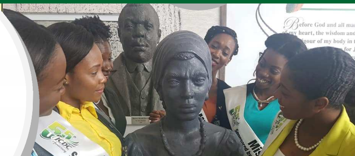
The JCDC parish queens were in awe with the bust of Jamaica's only heroine— NANNY of the Maroons