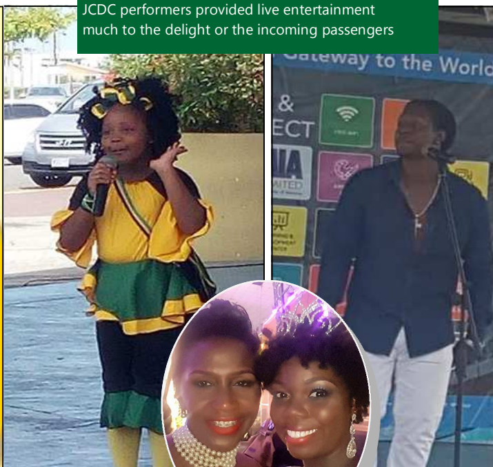
JCDC performers provided live entertainment much to the delight of the incoming passengers