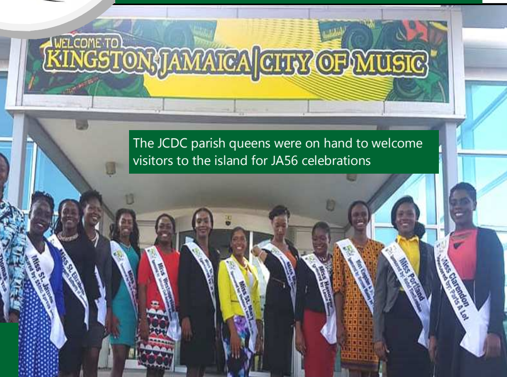
The JCDC parish queens were on hand to welcome visitors to the island for JA56 celebrations